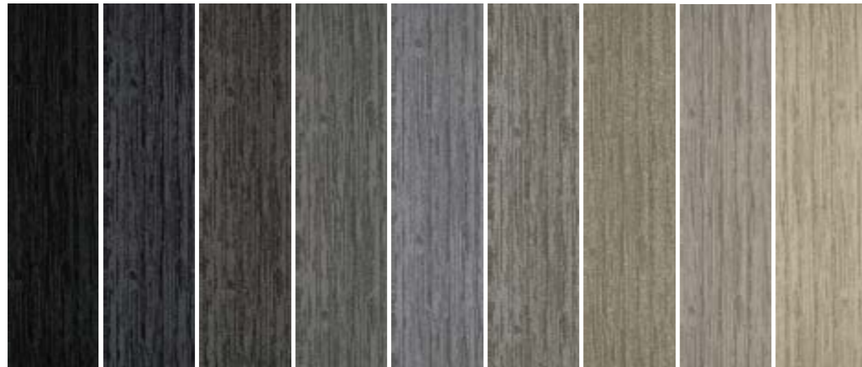
Aarup 100 Polar Night Aarup 200 Skandi Aarup 300 Fjord Aarup 400 Monsoon Aarup 500 Mountain Mist Aarup 600 Cloudy Aarup 700 Pine Cone Aarup 800 Pinus Aarup 900 Oak Wood