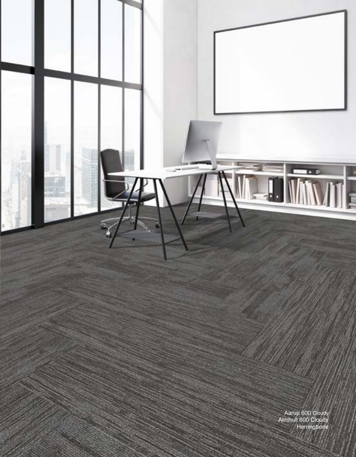
Aarup 600 Cloudy Almhult 600 Cloudy Herringbone