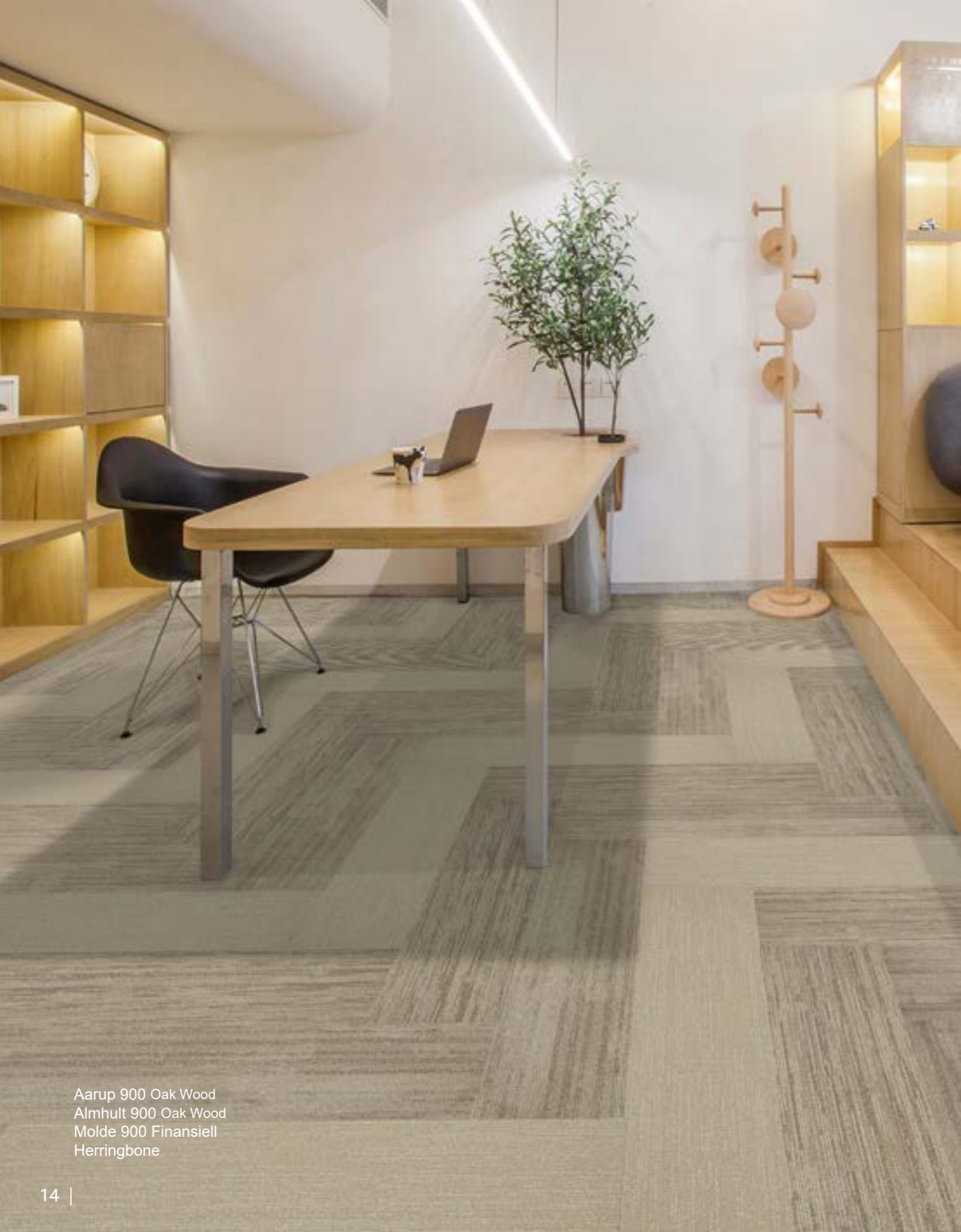
Aarup 900 Oak Wood Almhult 900 Oak Wood Molde 900 Finansiell Herringbone