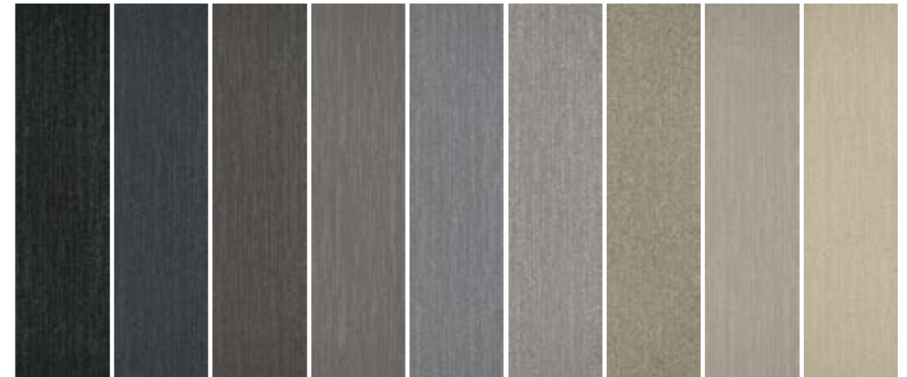
Molde 100 Matte Black Molde 200 Kendall Charcoal Molde 300 Stone Wall Molde 400 Heathered Grey Molde 500 Grey suit Molde 600 Shady Lady Molde 700 Kraftpaper Molde 800 Flax Molde 900 Finansiel