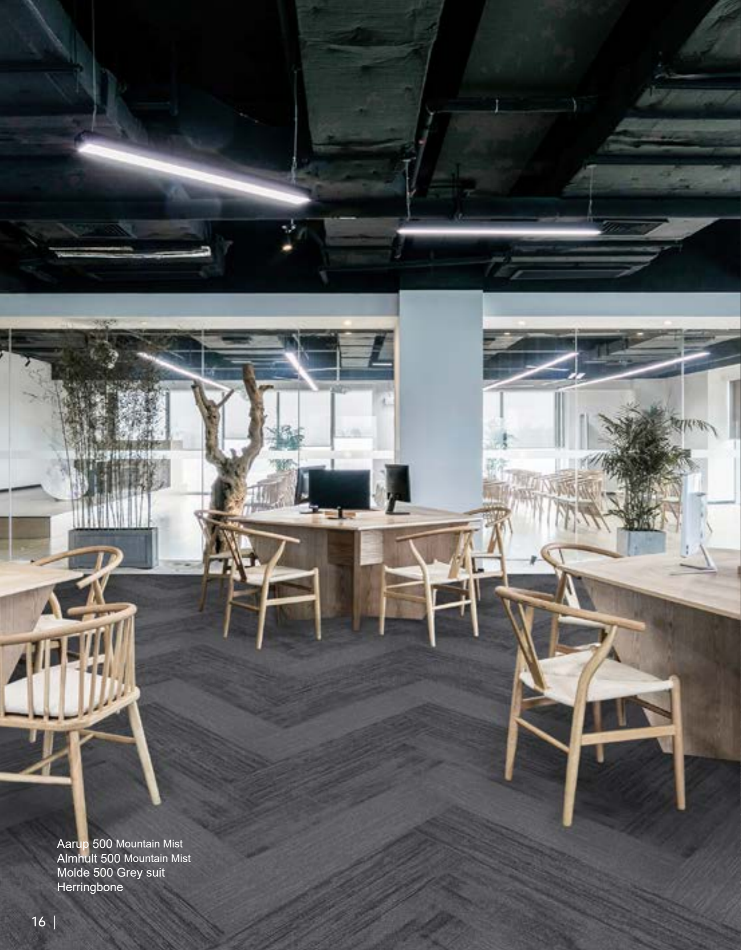
Aarup 500 Mountain Mist Almhult 500 Mountain Mist Molde 500 Grey suit Herringbone