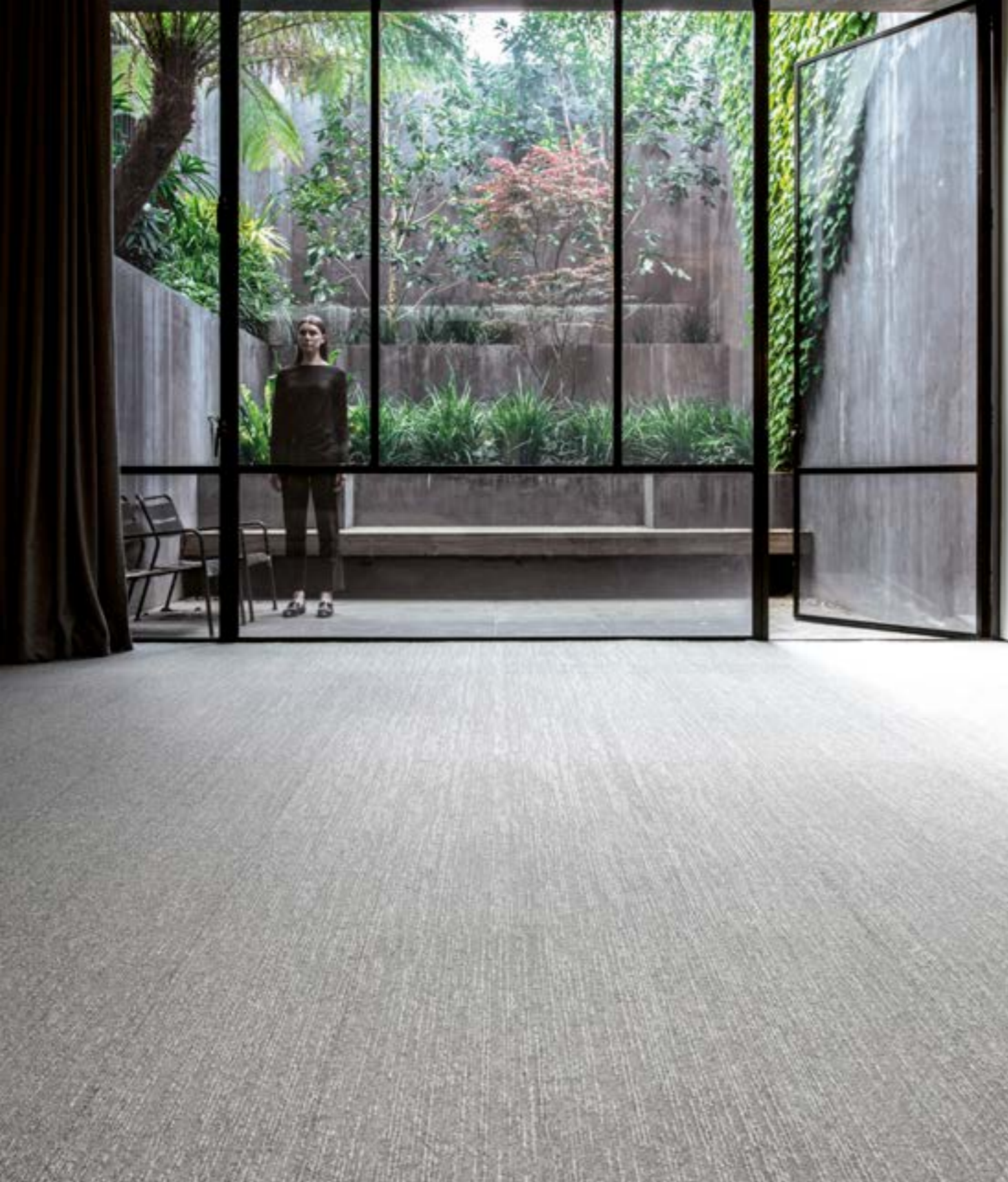
Molde 600 Shady Lady Ashlar