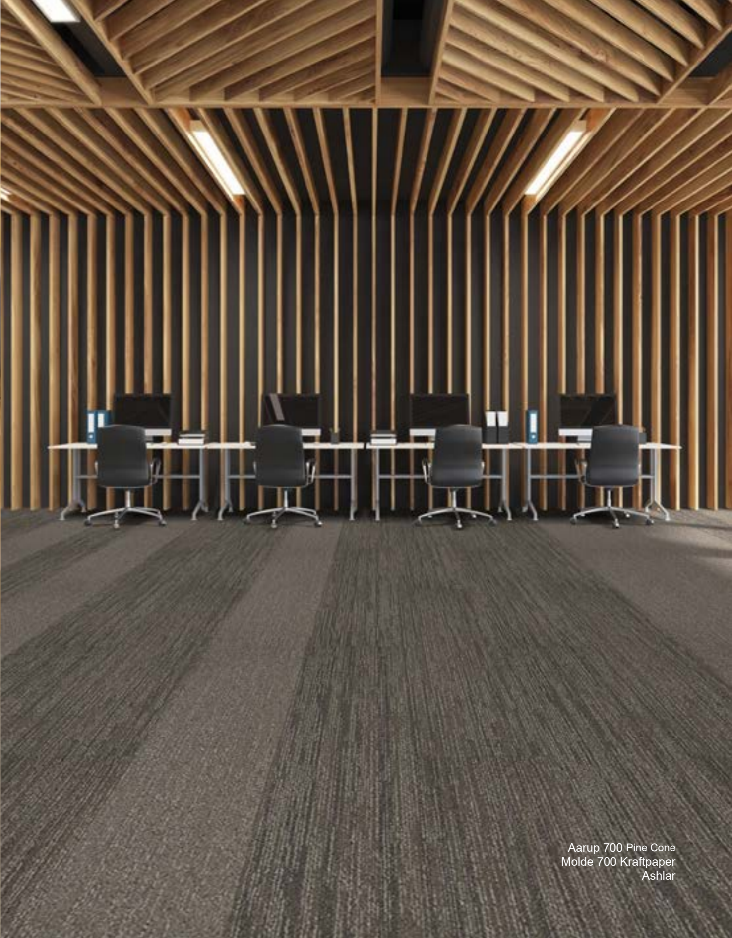
Aarup 700 Pine Cone Molde 700 Kraftpaper Ashlar