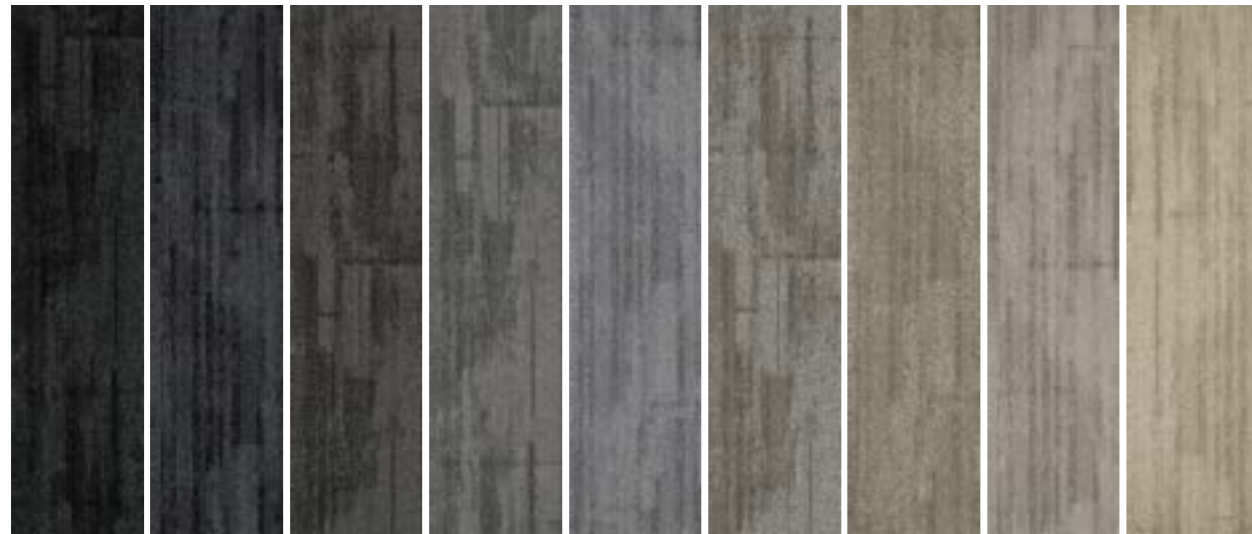
Almhult 100 Polar Night Almhult 200 Skandi Almhult 300 Fjord Almhult 400 Monsoon Almhult 500 Mountain Mist Almhult 600 Cloudy Almhult 700 Pine Cone Almhult 800 Pinus Almhult 900 Oak Wood