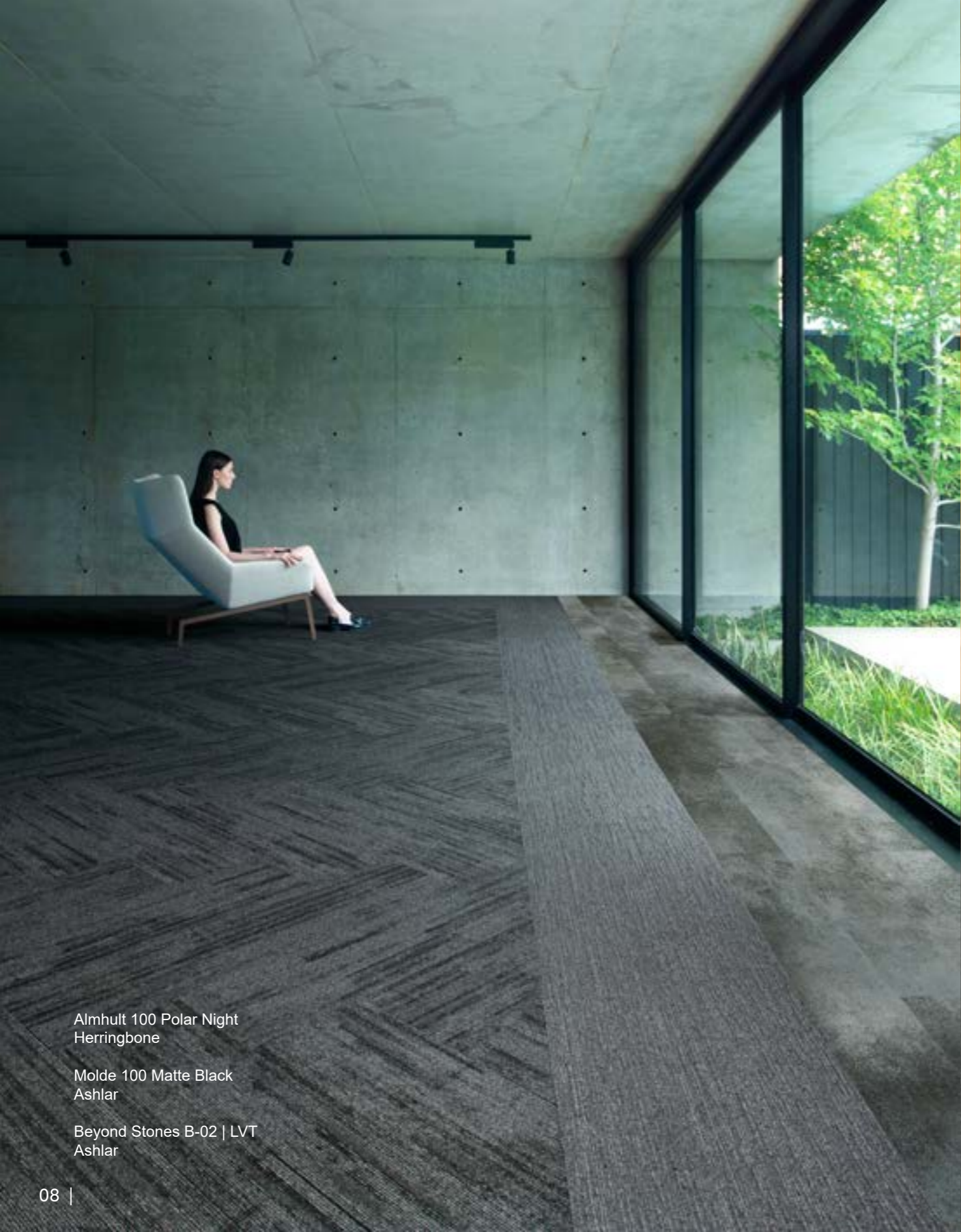
Almhult 100 Polar Night Herringbone