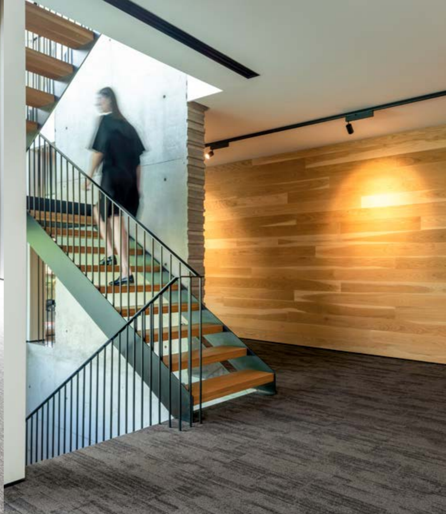
Almhult 300 Fjord Ashlar